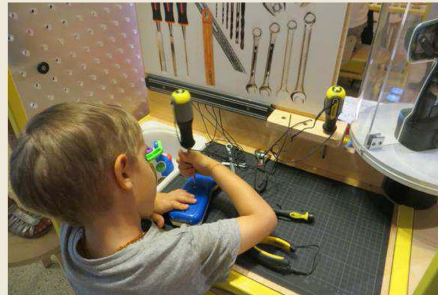
Fabrik, Exploradome – Paris – France From 6 years old