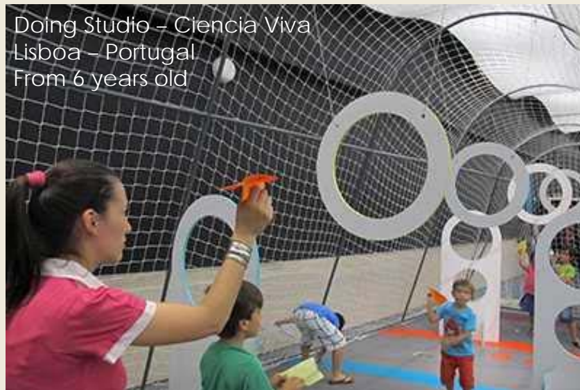
Doing Studio – Ciencia Viva Lisboa – Portugal From 6 years old