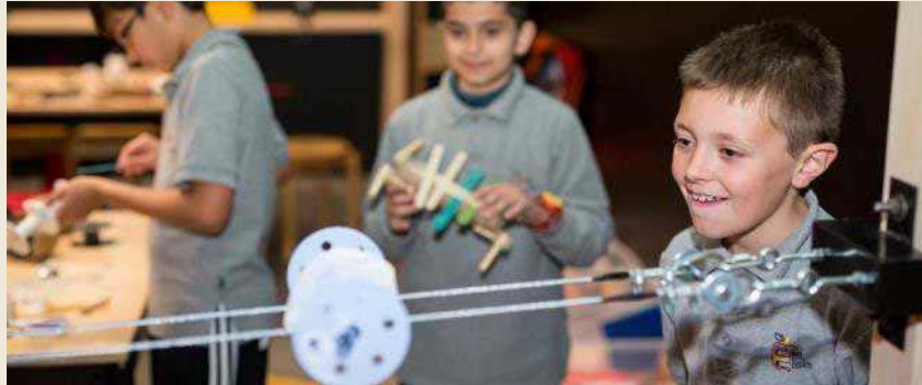
Fabrik, Science Center – Montreal – Canada From 6 years old