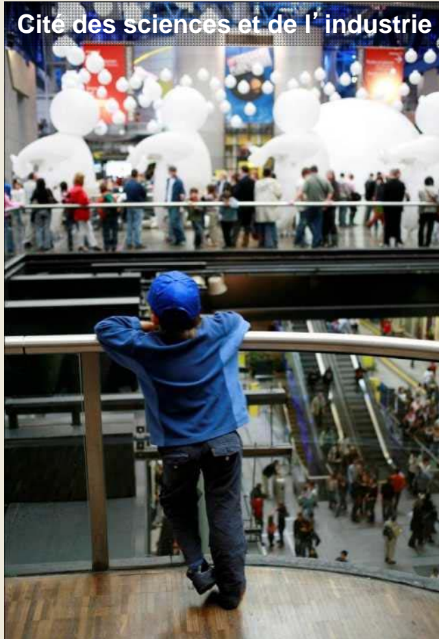
Cité des sciences et de l'industrie